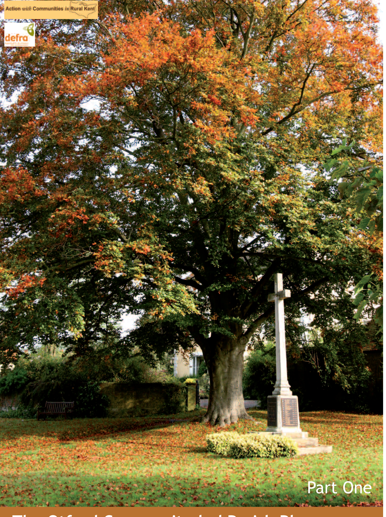
The Otford Community-led Parish Plan