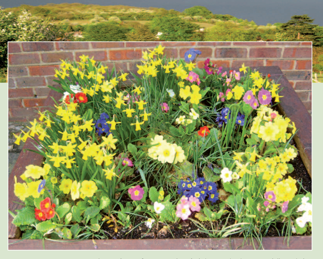
A planter of spring flowers outside Otford Pharmacy brightens-up a dull March day..

"Bubblestone Parade looks very depressing and down-market. It needs to be made more in keeping with the village character. Signage, trees, hanging baskets... Pedestrian safety is continually compromised by people who park beside the shops."