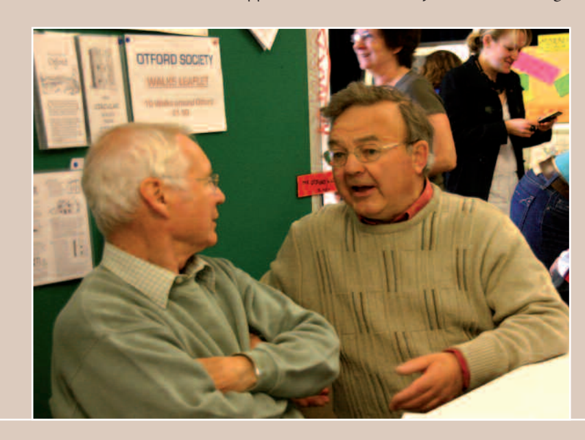
Below and opposite: consultation days within the village

This is a long-term plan. Our Parish cannot expect to reach all the stated objectives quickly, especially in these difficult economic times. Some may take years. This makes the objectives no less valuable. We hope the Plan will provide all of us with an aspirational roadmap to follow so that we can secure an even better future for our community.