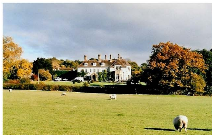
Examples of local architectural style