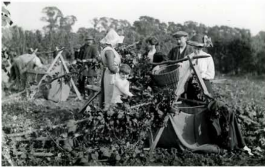
Hop-picking in Underriver pre-1914