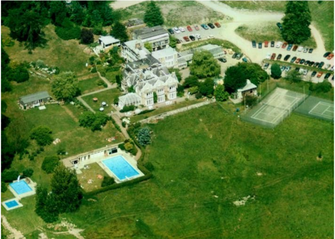
St. Julians club and business complex on the outskirts of the village.