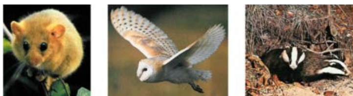
Examples of wildlife found in Underriver

R25 Any impacts by development on the important designated sites and ancient woodland within the area are to be fully mitigated. The replacement of dead and dying trees should be avoided, unless they are a health and safety risk. Dead and dying wood provides important habitat for bat species and the special invertebrates found within ancient woodland habitats.