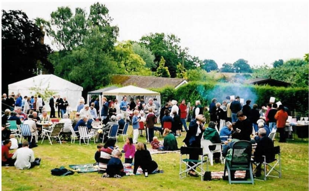
Millennium party, June 2000, & below Cricket in Underriver