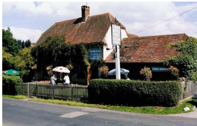
The White Rock Inn and restaurant in the heart of the village

R14 Adequate provision should be made for off-road vehicle parking, which should be screened with native species where appropriate.