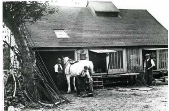
The Underriver Forge pre-1914