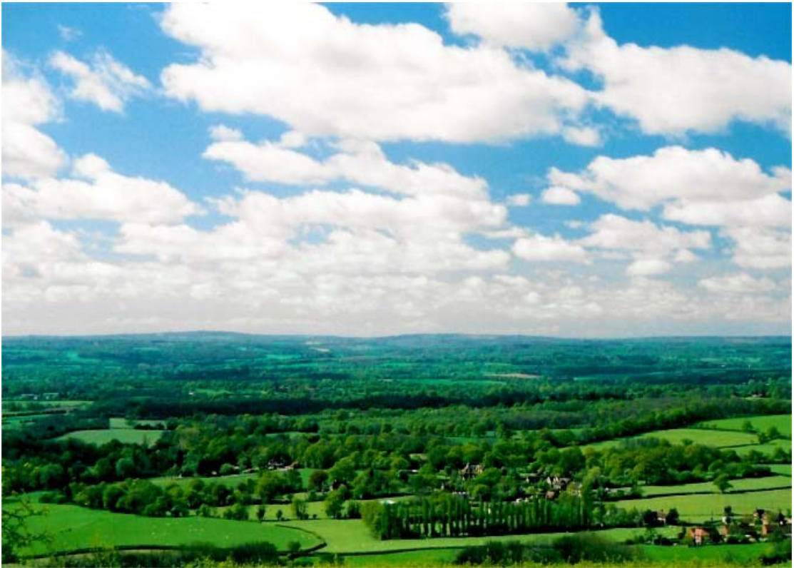
View of Underriver from the Greensand Ridge