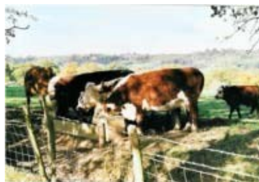
Mixed Farming in Underriver