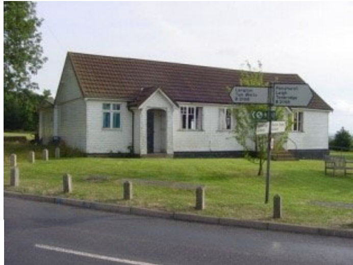
Previous Fordcombe village hall