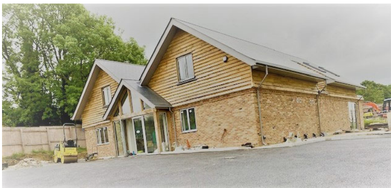
New and improved Fordcombe Community and Sports Hall