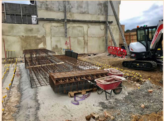
Metal reinforcing for the new development's foundations. The props for the neighbouring building can be seen in the background.

Once the foundations are complete, you will see the steel frame for the work hub and homes go up in the coming weeks.