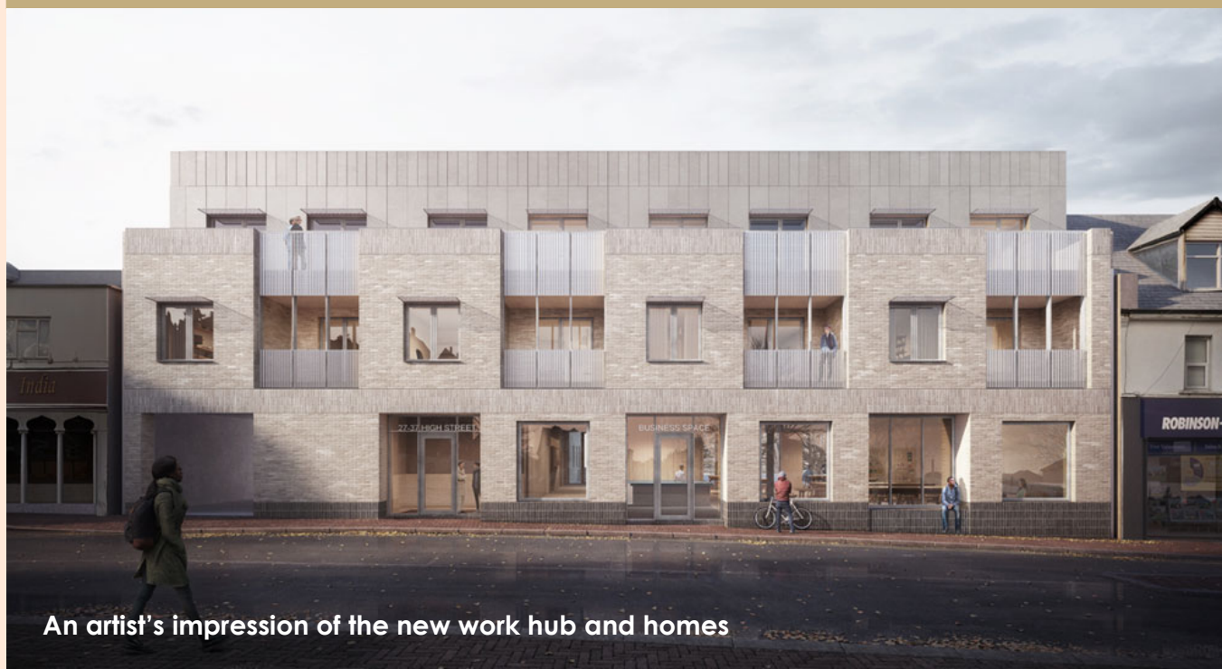
An artist's impression of the new work hub and homes

Welcome to the first issue of our newsletter. We are Bromley-based construction company Guildmore and we've been appointed by Sevenoaks District Council to build an exciting new work hub and homes at 27 to 37 High Street, Swanley, known locally as the former 'Meeting Point'