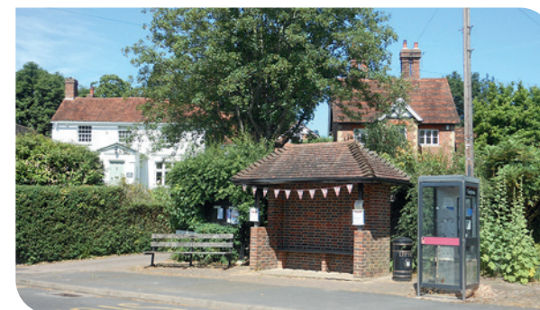
Standard modern street furniture