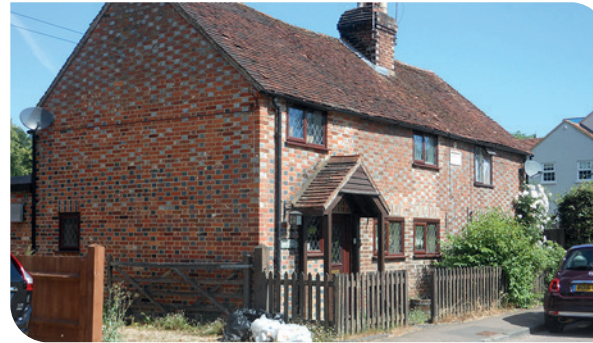
Simple building forms