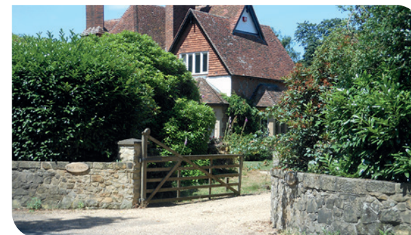
Stone boundary walls