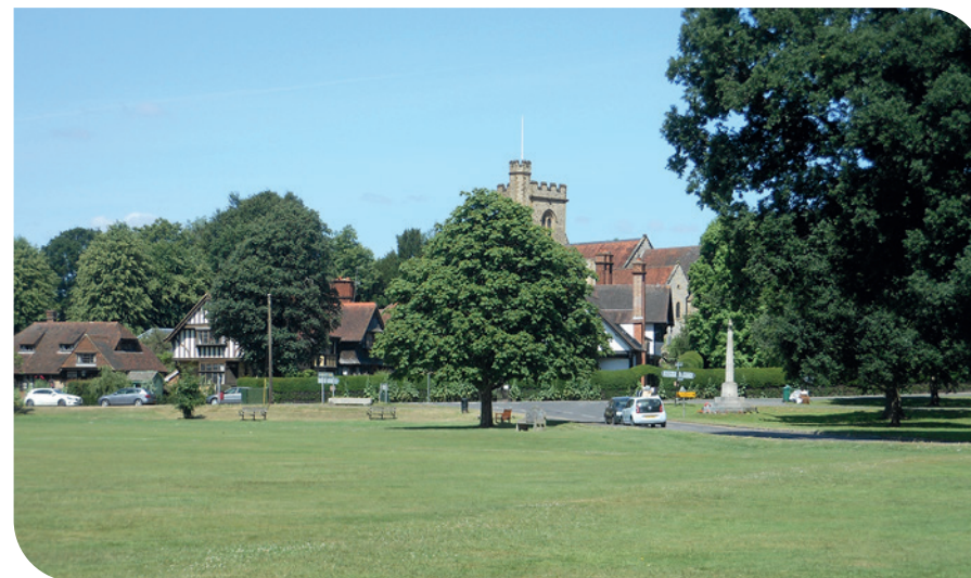
Townscape views within the conservation area which include a mix of building types and materials and give a sense of the spatial character and architectural quality of the village. Trees play an important part in these views, but are sometimes intrusive (Views 1–3, 5 and 6).