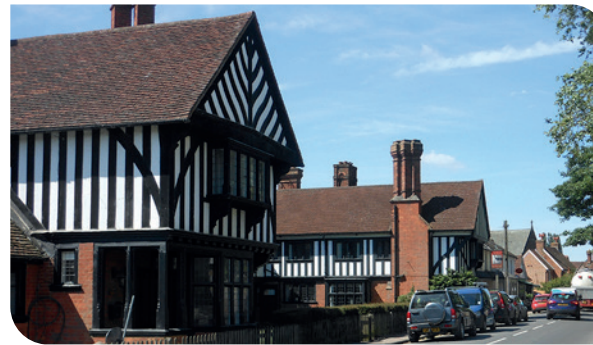
Composed groups Steeply pitched roofs