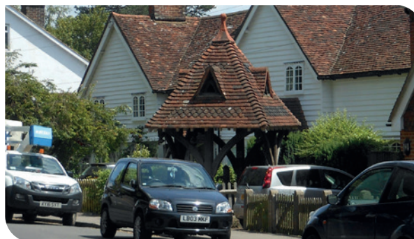
The Well House

Road and pavement surfaces are generally tarmac, with a mixture of granite and concrete kerbs, and as such are neutral in their contribution.