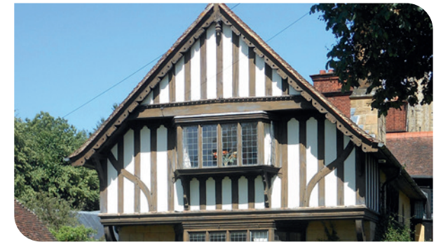
Steeply pitched roofs