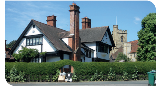
More complex building forms