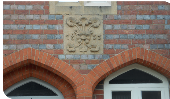
Red brick patterned with grey brick