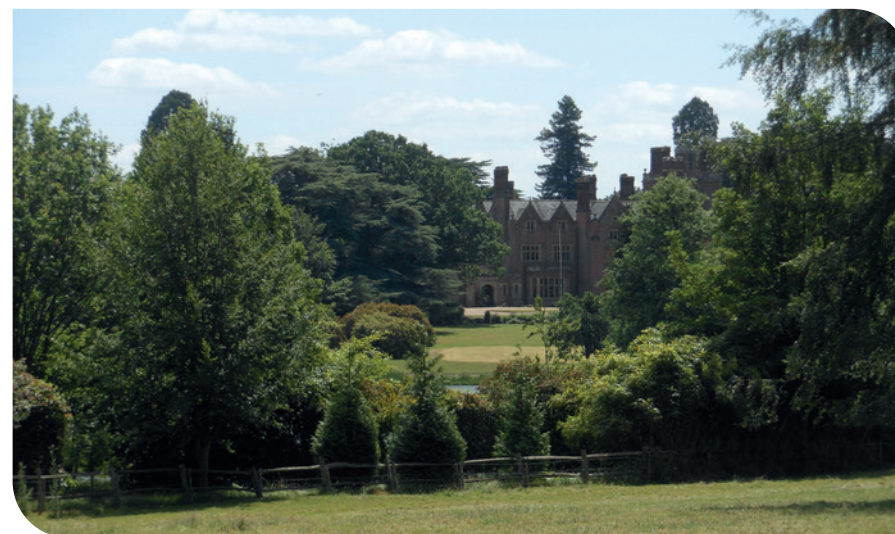
Scenic views from outside the conservation area towards Hall Place and the village, which help to appreciate its rural setting (View A).