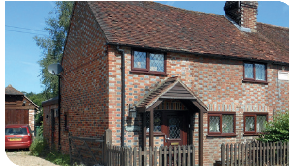
Local red brick