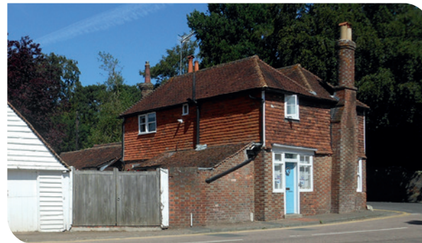
Early Victorian domestic