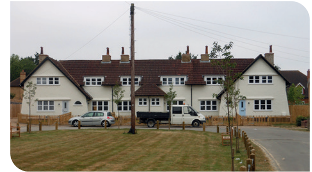
Half-timbering and wooden shingles