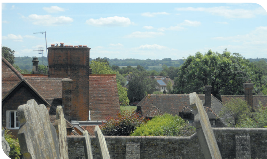
Contextual views which look out to the landscape beyond the conservation area and give an understanding of its topography and rural setting (View 4).