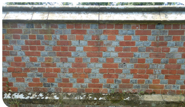
Brick estate wall to Hall Place