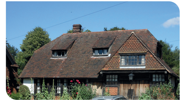
Clay tile roofs and tile-hanging