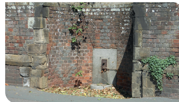
Drinking fountain in the park wall