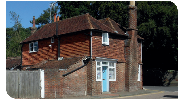
Clay tile roof and tile-hanging