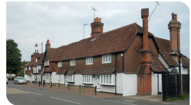
Tall brick chimneys