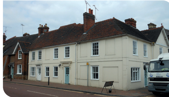
Small scale and domestic