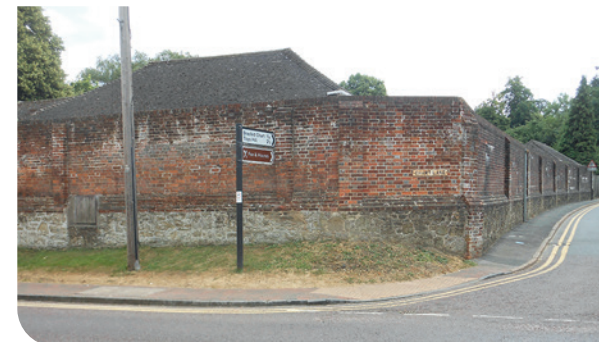
Kentish ragstone and brick walls