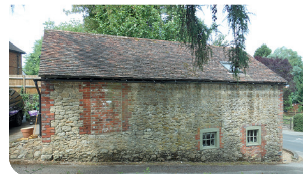
Rubble stone walls