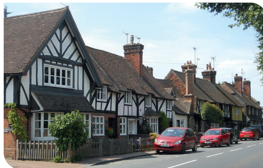
View 2: townscape view looking west