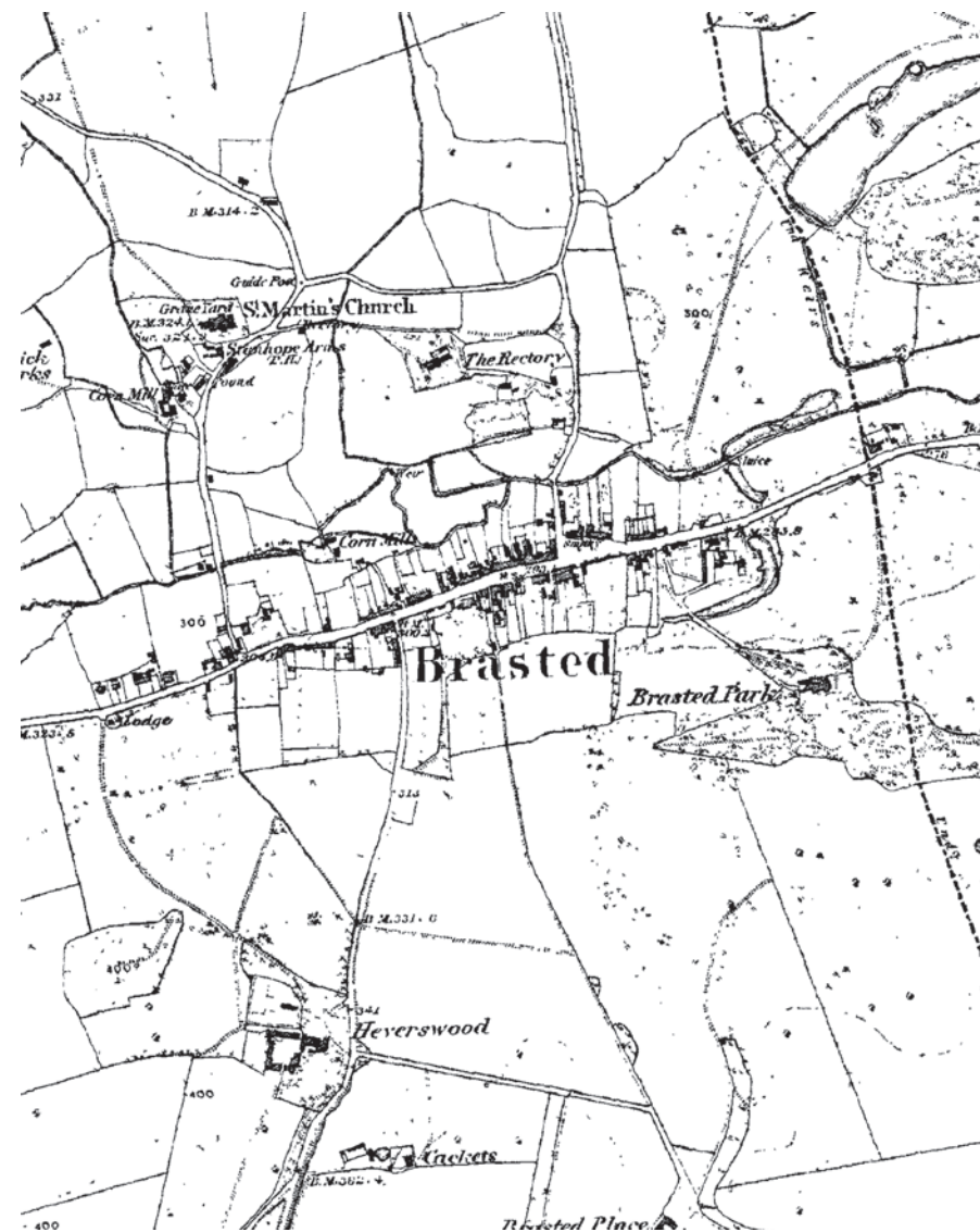
1873 edition of the Ordnance Survey

The village evolved gradually during the nineteenth century, with development slowly extending further west along the High Street, with the construction of Hawthorn Cottages and Vine Cottages in the second quarter of the century. In 1881 the mill was built, continuing the centuries-old use of the River Darent for milling. The process of rebuilding and refronting older buildings continued in the late nineteenth century with buildings such as White Hart Cottages and Tilings remodelled in a vernacular revival manner. The White Hart was rebuilt on a large scale in an Old English style in 1885.