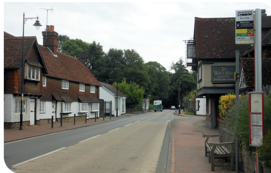
View 1: townscape view looking east

The photographs reproduced here are illustrative of these views but are not definitive because of the dynamic nature of the views.