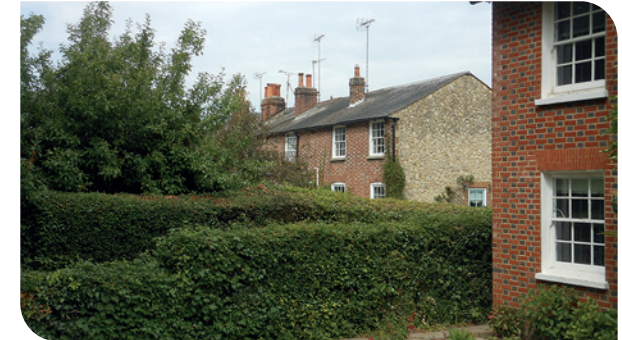
Simple rectangular forms