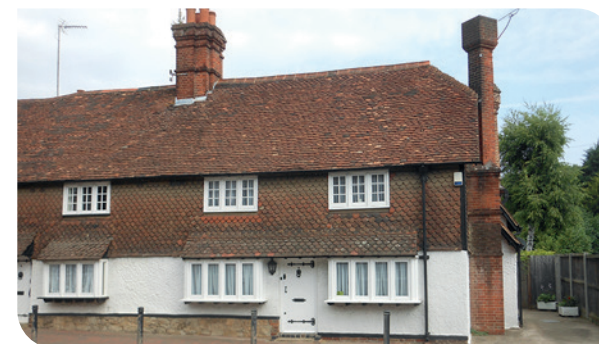
Clay tile roof and tile-hanging