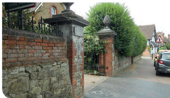
Substantial gate piers Brick paving