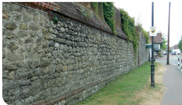
Kentish ragstone wall

Surviving historic street furniture such as the nineteenth-century pump and the K6 telephone kiosk on the Green, and the Royal Mail pillar box opposite, all add to the historic character of the streetscape.