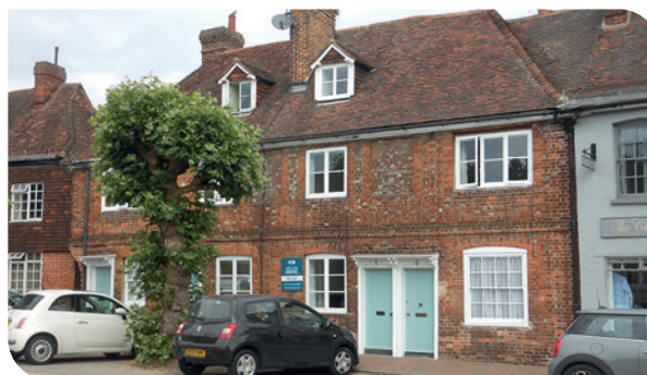
Local red brick