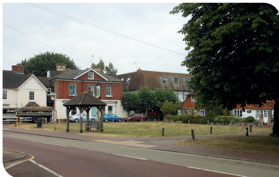
View 2: townscape view across the village green