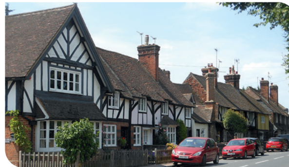
Traditional pitched roof forms