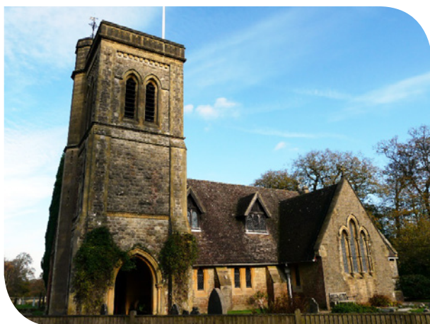
St. Lawrence Church