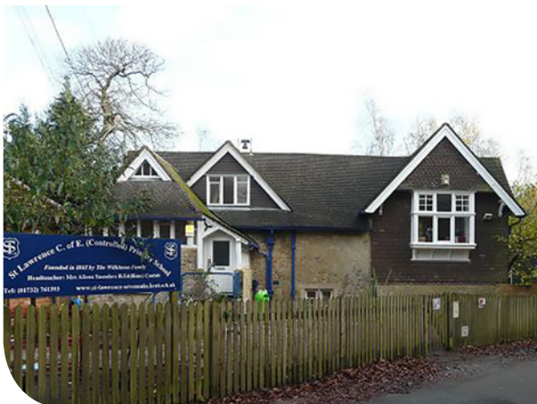
St Lawrence School