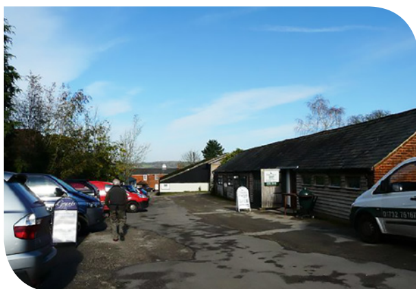
Chart Farm Businesses