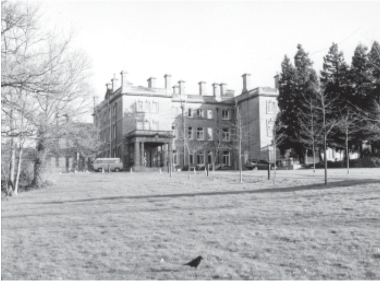
Dorton House - Royal London Society For The Blind

Council which has extended the existing Conservation Area to cover virtually the whole Estate.