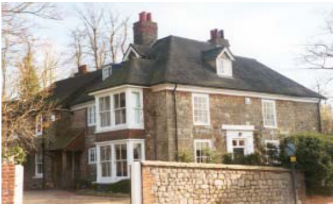
The Grey House - an historic village house

strongly resist any such moves. In an attempt to be realistic, residents were asked where, if at all, such new housing might be provided. Very few sites within or around the village were suggested for this purpose. In any case, the local infrastructure, particularly sewage and land drainage facilities, seems inadequate to support any such expansion without significant new investment. But if such major new development is authorised, this Village Design Statement may have to be reconsidered.