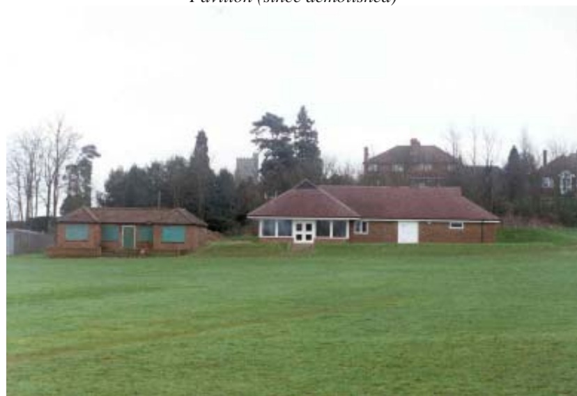
The New Sports Pavilion on Seal Recreation Ground next to the Old Sports Pavilion (since demolished)

3.3 Can the demand for cars be reduced by better public transport? Because most residents work and shop outside the village, and all the older children go to school elsewhere, there is heavy use of private cars. In the 1991 census, 530 families, out of 779 in Seal Ward, owned at least one car, and 105 had three cars or more. Two points emerged strongly from the current consultation. One is that the existing bus service, while much better than in many surrounding villages, could be made more convenient without much extra cost. Better-timed connections with the trains, extending