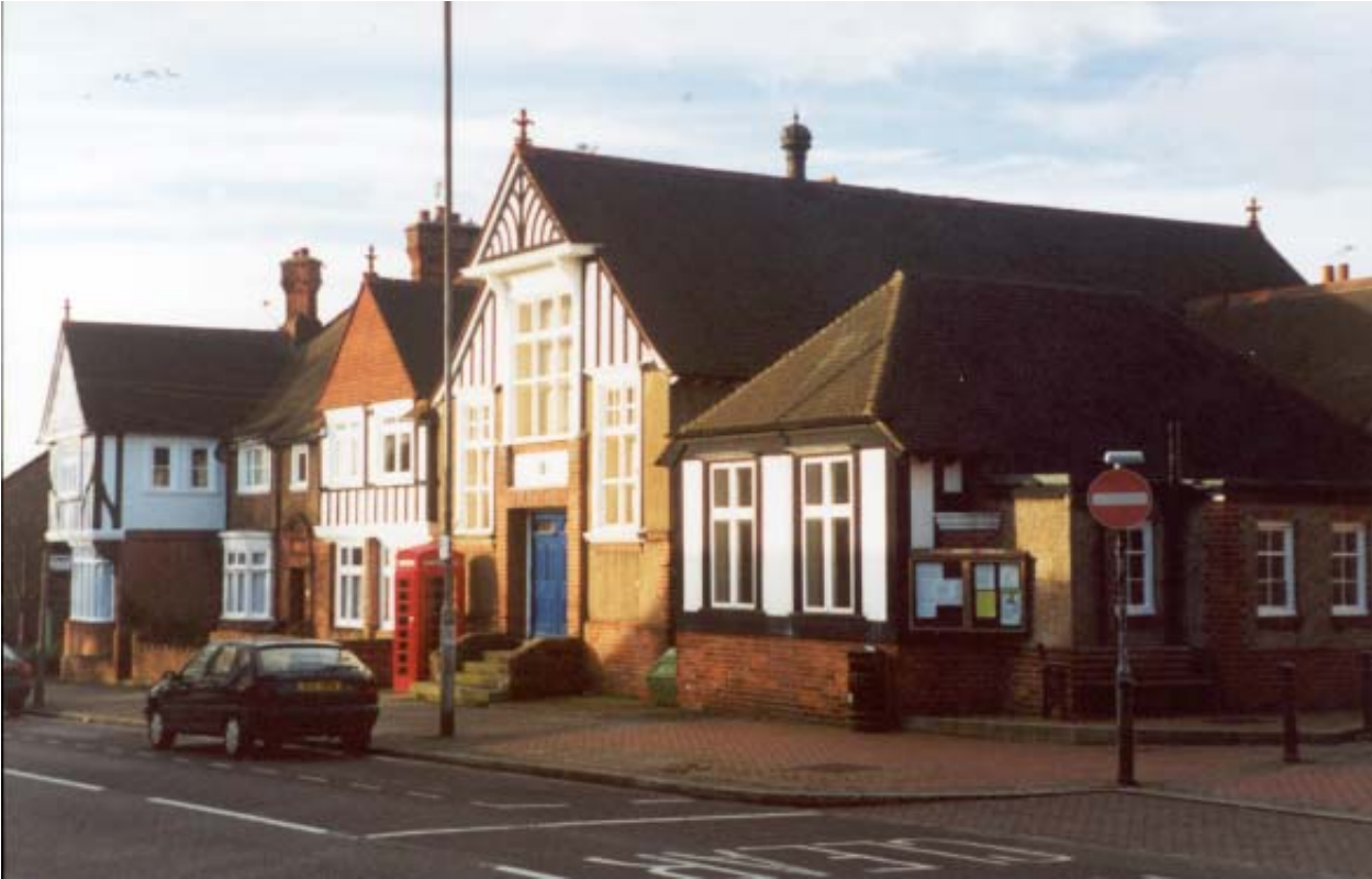
Above: Seal Village Hall in High Street Below: Seal High Street on a quiet Sunday morning