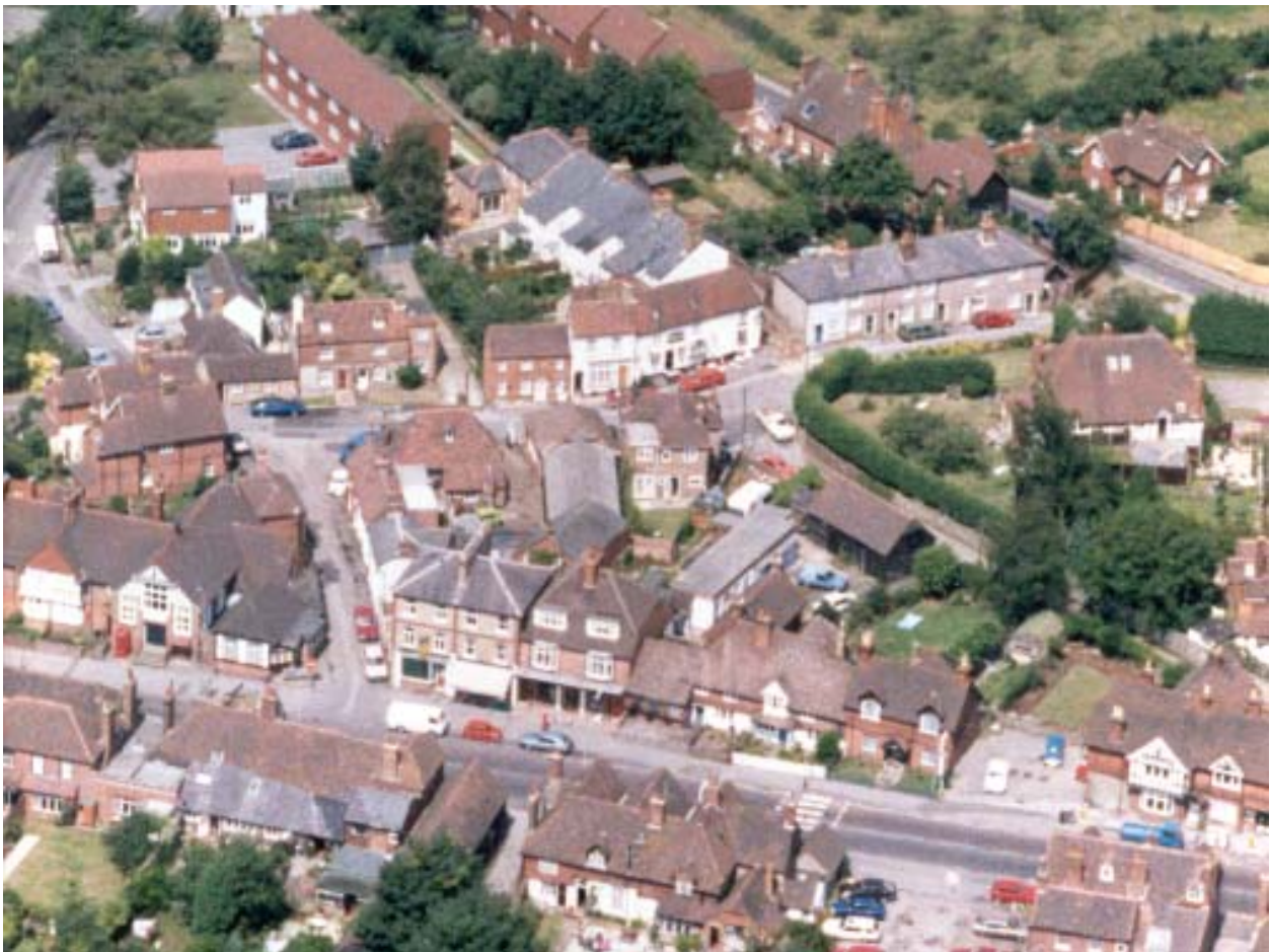
Aerial view of village centre

This Statement is the product of a lot of discussion within the local community. It started with a questionnaire distributed to all the residents with the local newsletter. That was followed by a public meeting in the Village Hall. After redrafting, it was then approved by the Parish Council on 13 March 2003 and sent to the Sevenoaks District Council for further statutory consultation.