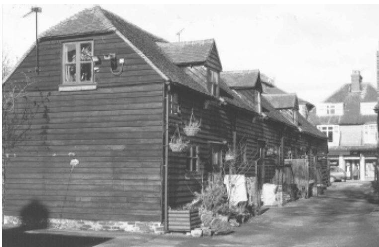
Sympathetic conversion of Black Barn

buildings is now being drawn up; more information from owners will be welcome. We understand that English Heritage is also preparing a web-site of listed buildings for the whole country, which will include Kent; some local buildings have already been photographed for this purpose. Apart from the church (reclassified as Grade I early in 2002), which is basically a thirteenth-century building with later additions, there are no specially-distinguished buildings here of great architectural merit – they are all Grade II in the government lists. Some are very old: there are two Kentish Hall Houses: the Kentish Yeoman and 31 High Street (next to the butcher’s shop). Recent