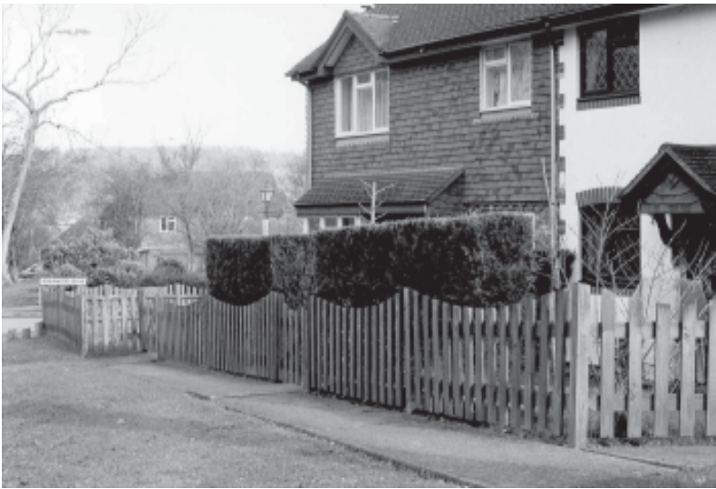
1990's Housing Development of Starter Homes at Robinwood Drive

discoveries suggest that the Crown also contains some very old timbers in the roof and an ancient fireplace. Forge Cottage in Church Road, with a splendid vaulted cellar beneath it, is about fifteenth century. The rest are mainly eighteenth or early nineteenth century. But individually and perhaps more importantly in groups, they are what people remember about Seal.