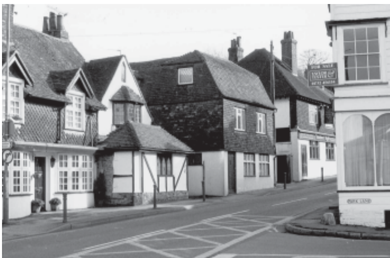
Dangerous junction where Park Lane meets Seal High Street

7.2 Designed from the outset to retain the original estate roads and much of the original planting, it was the developer's desire to maintain the impression of single homes situated in the countryside. To this end, he encouraged a number of well-known architects to design the first houses on the Estate, including several representatives of the then flourishing Arts and Crafts Movement, notably H. M. Baillie Scott. Many of the houses are of great individual merit, and the importance of the area has now been recognised by Sevenoaks District