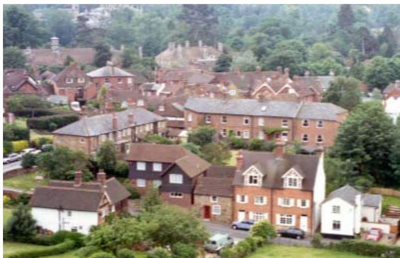
View of Seal from Church roof with Childsbridge Lane in foreground and looking south-west toward Sevenoaks

Seal is a very old village, standing at the edge of the greensand ridge above the Holmesdale valley. Originally an agricultural centre, it is now largely a commuter settlement. But it has retained its rural look and its separate identity. The village was originally built out of local materials, mainly ragstone, with a bit of flint from the other side of the valley, or local timber (oak and chestnut, mainly), and with locally-made bricks and tiles, whose warm colours now give the village its typical Kentish character. It grew naturally out of the landscape.