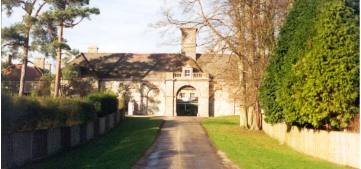
Entrance to Seal Laundry - former stables to the Hillingdon Estate