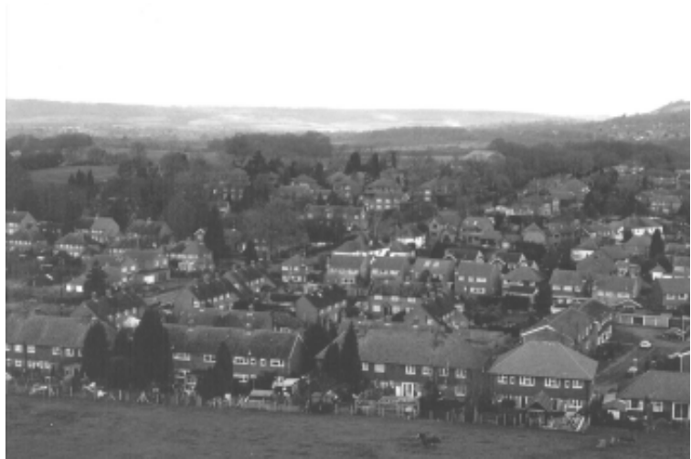
Modern Housing, to the north of Seal Village Centre

By comparison with other local centres, Seal is quite well-served by community facilities, and the residents saw little need for further provision. The church still provides an important focus for village life. The village hall and the church hall, with the Memorial Pavilion on the Recreation Ground, the school hall, and the old scout hut, between them provide space for a very wide range of village activities, both formal societies and informal groups. The pubs and restaurants already