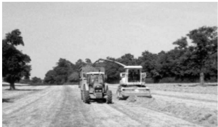
Typical farming scene in Seal

Fullers Hill, etc.). The District Plan recognises that these must also be protected. While changes and additions to these buildings may occasionally be allowed, even for industrial or commercial use, and would be welcome if they generate additional jobs, the Local Plan requires that these must be well-designed and not intrude on the longer views. The village strongly supports this policy. (R5, R6, R7)