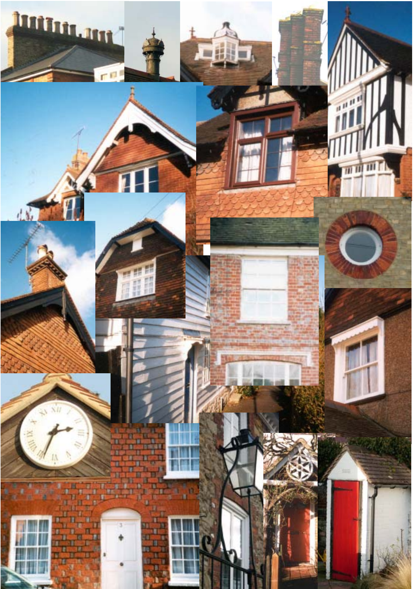
Various architectural features, old and new, combine to present a unique image that is SEAL