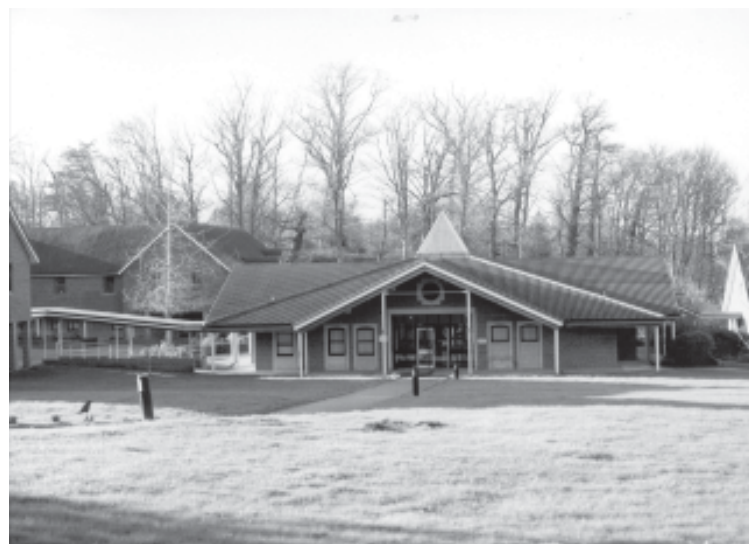
New Buildings at Dorton College

8.5 Godden Green provides a central location for rural activity – walking, riding, visiting Knole Park- but is limited in the provision of other community facilities. The Prep School, pub and Godden Green Clinic (formerly Mary's Mead) generate some local focus, as does the Green itself. A very restricted bus service exists with links to Sevenoaks and surrounding villages. Some residents have suggested that the hamlet could sustain a village shop or some form of communal use of the green to encourage local user interaction. The Old Post Office on the green originally served this function. Inappropriate parking around the green has been an issue in the past and needs occasional monitoring, but generally visitors to the area are respectful of the hamlet's rural quality. Physically the defining character of the hamlet is complete. Its rural setting, open green configuration with different but sensitively scaled buildings bordering two sides offer little scope