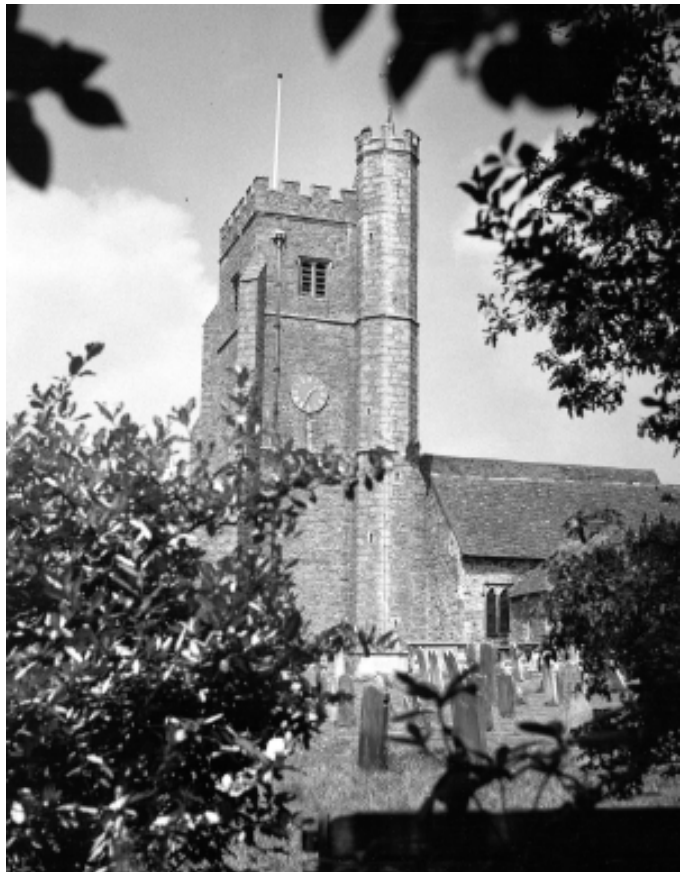
Church of St Peter & St Paul, Seal

The village has expanded along Childsbridge Lane in the half -century since the war, in several phases. There is former Council property (some of it now managed by the West Kent Housing Association, and some now privately owned) at Zambra Way, Ragge Way and Wilmar Way and Bentley's Meadow. (Some non-traditional construction properties will be replaced here in the next few years and others are now being extensively modernised). There is also much modern private housing, for example in Meadowlands and most recently at Robinwood Drive. (Infrastructure problems, notably flooding caused by inadequate surface drainage, may be a problem). Nearly all of this is in a pleasant unobtrusive style, using traditional materials, which relates well to the original core of the village. These areas are well planted with trees, and most of the gardens are carefully maintained. A few discordant notes intrude - usually new windows or doors, or unusual colour schemes. Parked cars are sometimes visually intrusive, but these roads were not designed to accommodate the present levels of car ownership, and there does not seem much chance of improving the