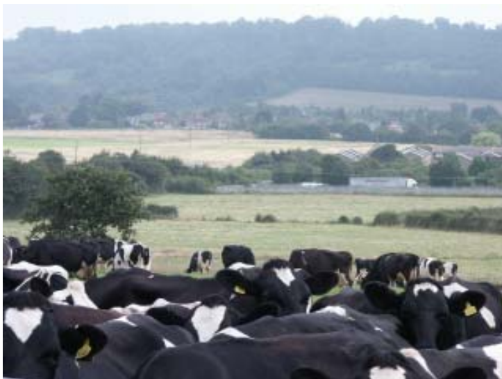
The last cows at Penfield Farm

9.2 As so often in Kent, this countryside is scattered with small groups of farms and cottages. Some of these are Listed Buildings (Penfield, Waterden, the old farmhouse at Fullers); others, while not so safeguarded, are of great value to the local scene (Tanners Cross,