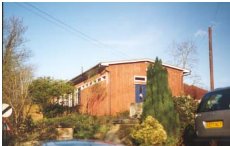
Seal Church Hall (opp. church) - wood structure

1.5 So Seal is a well-defined separate village, with a typical Kentish character, within clear natural boundaries, and surrounded on three sides by agricultural or wooded land. It is very clear from our consultation exercise that the residents want to keep it that way.