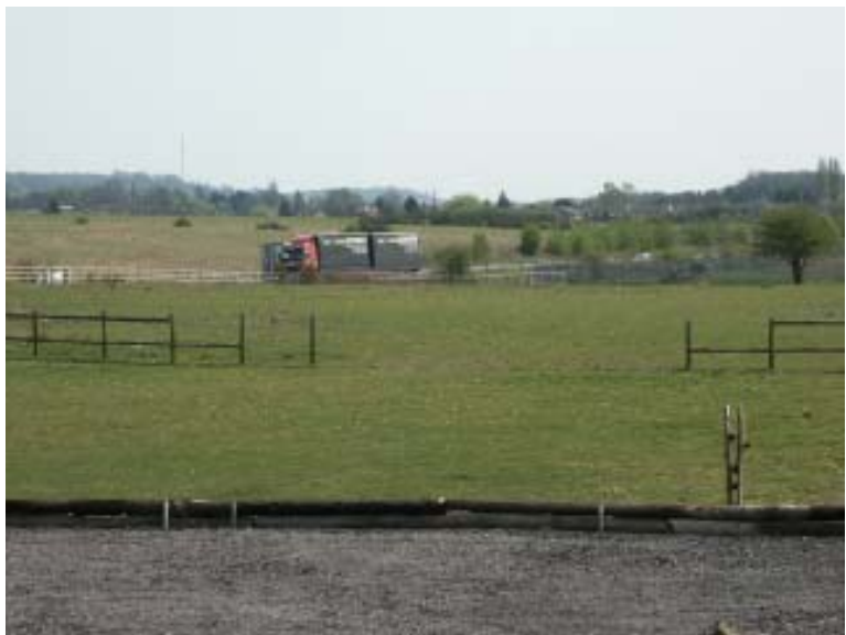
The M26 breaks up the view to Kemsing from Seal

2.2 There does not seem much scope for further expansion of this local economy. The District Plan makes no allocation of large sites for business development here (or elsewhere in Seal parish). It does provide for small-scale development or conversion of sites, subject to fairly rigorous tests, and provided no housing is lost in the process. But in fact there seems little commercial demand for this and although more local employment might be welcome, the local population is strongly against it, mainly because it