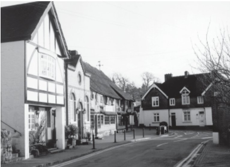
High Street from Church Street showing mix of building styles