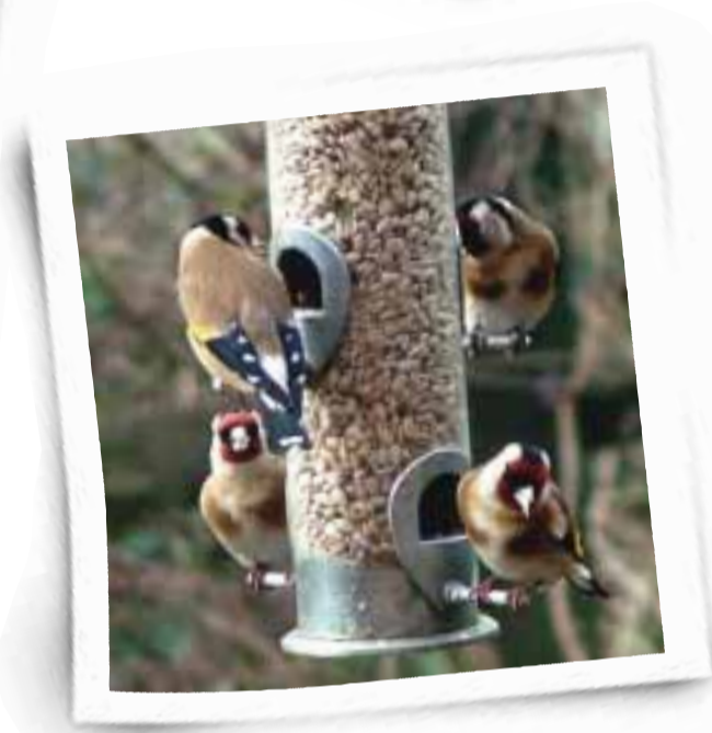
Photographs by entrants from last year's Gardening for Wildlife awards