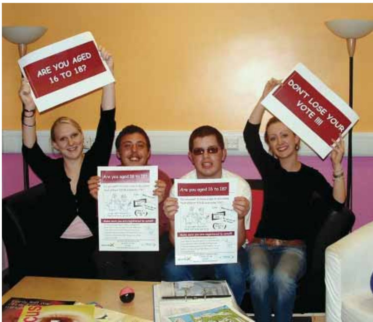
Part of the Generation X team with their posters encouraging youngsters to register to vote

Visit Sevenoaks District Council's website www.sevenoaks.gov.uk/youngpeople for more information.