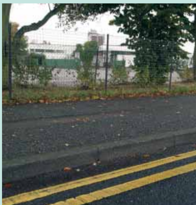
Yellow lines outside St Mary's School, Swanley