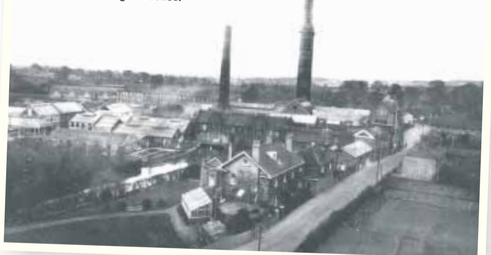
Horton Kirby Paper Mill seen from Horton Road during the 1920s.

“The mill employed some 450 people and produced 230 tons of paper every week”