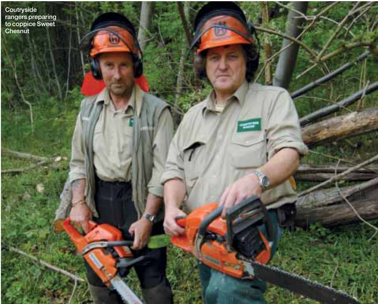
Couttryside rangers preparing to coppice Sweet Chestnut