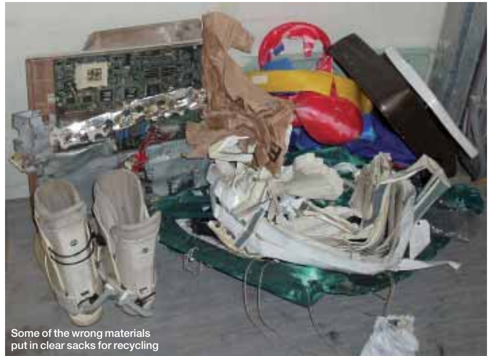
Some of the wrong materials put in clear sacks for recycling