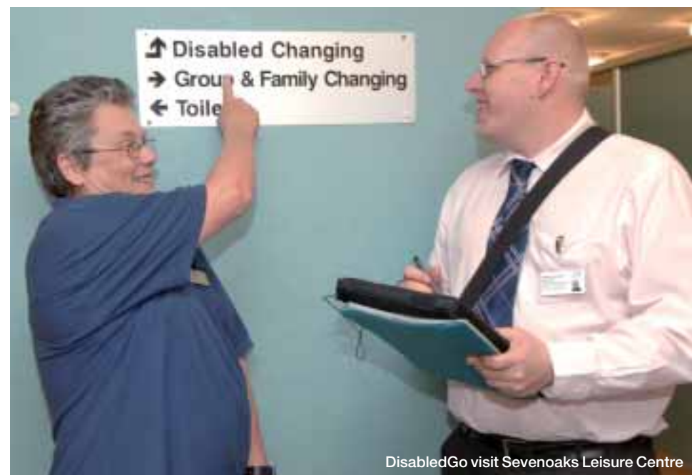
DisabledGo visit Sevenoaks Leisure Centre

Soon after fully trained DisabledGo researchers visited up to 1,000 venues across the Sevenoaks District including goods and service providers, hotels, tourist attractions, pubs and local libraries to establish how accessible they are to people with disabilities.