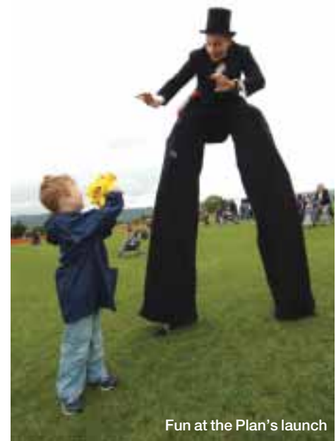
Fun at the Plan's launch

For more information, please visit the Council's website www.sevenoaks.gov.uk/communityplan or call 01732 227000.